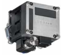
Sonic 2020-V with optional mounting bracket