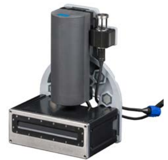
2022-V with optional mounting bracket