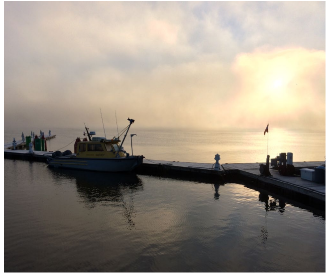
Figure 2: McKim & Creed’s survey vessel showing the Sonic 2022 echo sounder at the end of the mount.

We map a few passes in the Cape Fear River and the crew is starting to feel comfortable behind the wheel. I decide to change it up a bit and instruct the captain to get close to the nearby seawall. I figured it’s time to show them the vertical mapping capabilities of the system. As we transit parallel to the wall, we notice a peculiar object starting to take shape with every new ping of data. There, lying on the seabed is what looks like a Dodge pickup truck. And a newer body style at that! We decide to log a few more passes and the more we move around, the more vehicles we find. We’re all in disbelief and wondering how they got here.