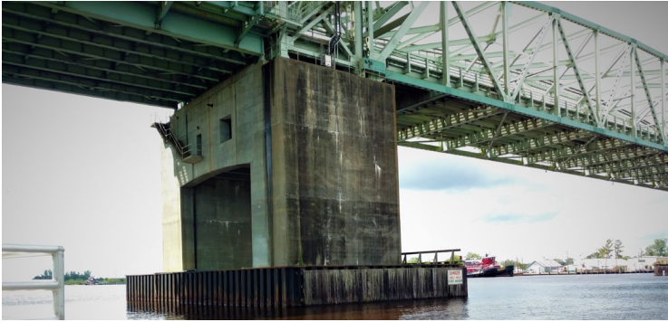
Figure 3: Investigation area is located just under the bridge and to the left, closest to the seawall.

As we meander around under the bridge, we catch the attention of a local police boat. They eventually come over and start questioning us. Ecstatic, we tell them what we've found. In disbelief, they board our survey vessel to peer over my shoulder and review the data that we just collected. One of the police officers mentions they've been looking for a Dodge Ram 1500 that was reported stolen a few weeks ago. Hmm, doesn't look good for the so-called "victim."