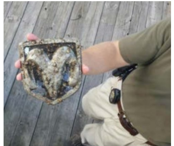
Figure 6: Piece of the vehicle in question, later retrieved by local police.