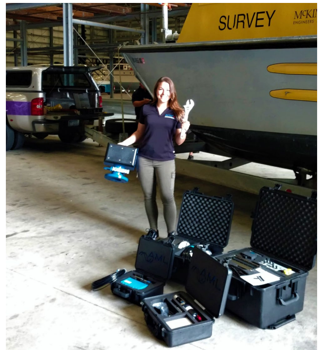
Figure 1: Author with installed equipment aboard “The Clock”, one of McKim & Creed’s hydrographic survey vessels

Then, I mount the GPS antennas to the vessel's roof with a clear and open view of the satellites above it. By that time, the crew has decided where they want the other peripherals, so those go in without a glitch. And thank God, we're dealing with a R2Sonic I2NS system today. The combined topside box for both the multibeam and inertial navigation system saves me from integrating multiple